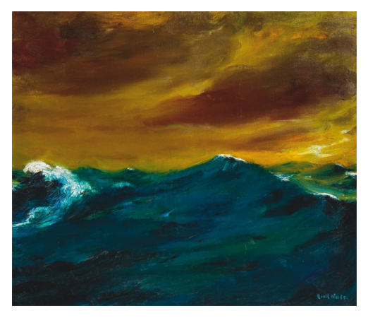
Emil Nolde. "Hohe See". 1939 Oil on canvas. 86 × 100 cm. EUR 1,000,000-1,500,000