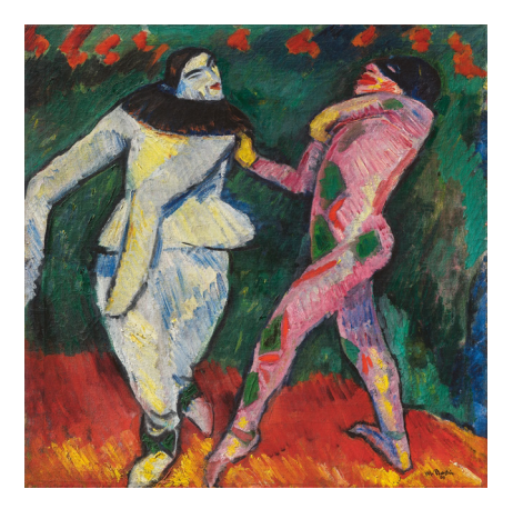
Max Pechstein. "Russisches Ballett". 1909 Oil on canvas. 100 × 100 cm. EUR 2,000,000-3,000,000