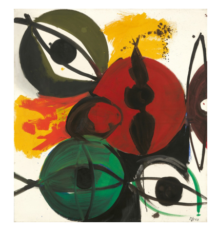
Ernst Wilhelm Nay. "Mit grüner Scheibe". 1964 Oil on canvas. 110 × 100 cm. EUR 250,000-350,000