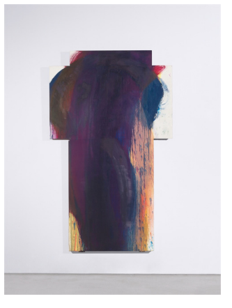
Arnulf Rainer. "Dunkle Figur". 1990/91 Oil on panel. 198.5 × 121.5 × 2.5 cm. EUR 180,000-250,000