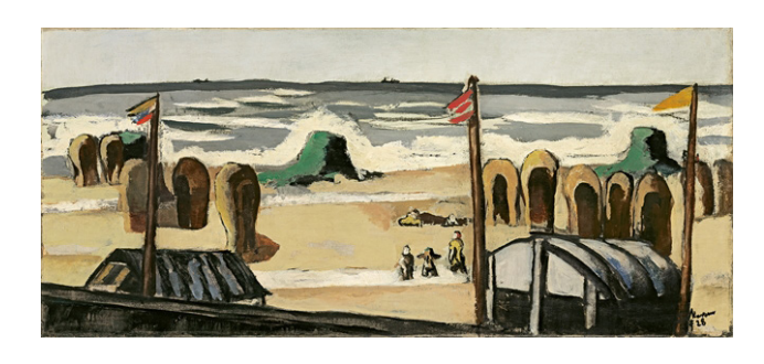
Max Beckmann. "Grauer Strand". 1928 Oil on canvas. 35.5 × 78.5 cm. EUR 1,000,000–1,500,000