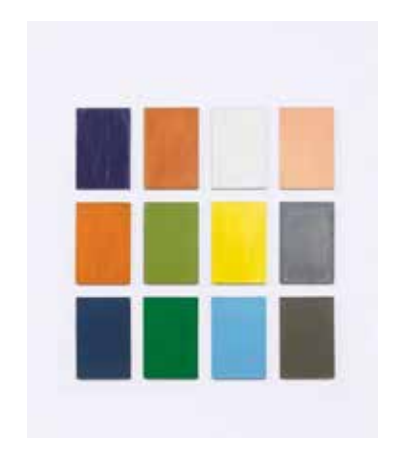
Günther Förg. Untitled. 1987. 12-part: acrylic on lead on wood Each 60.5 \times 40.5 cm. EUR 300,000-400,000