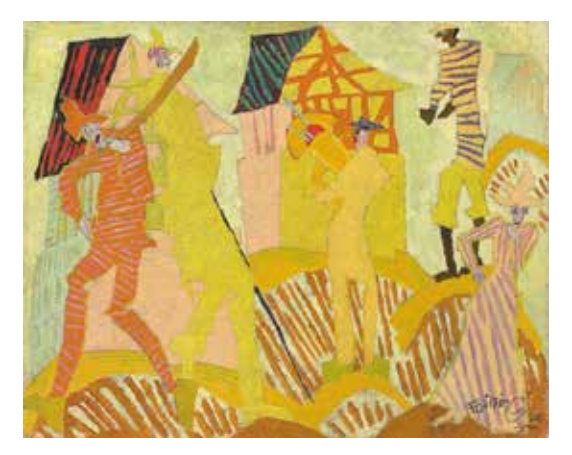
Lyonel Feininger. "Trompetenbläser im Dorf (Trumpeter in the Village)". 1915. Oil on canvas. 60\times75 cm. EUR 2,000,000–3,000,000