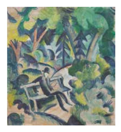
August Macke. "Mann auf Bank". 1913 Oil on cardboard. 56,1 × 51,1 cm. EUR 900,000–1,200,000