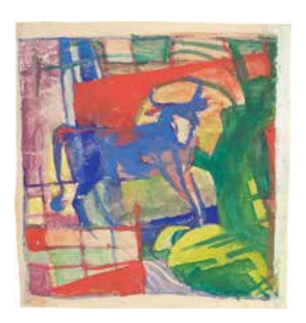
Franz Marc. "Blaue Kuh". 1913/14 Tempera on paper. 16.2 × 15.6 cm. EUR 700,000-900,000