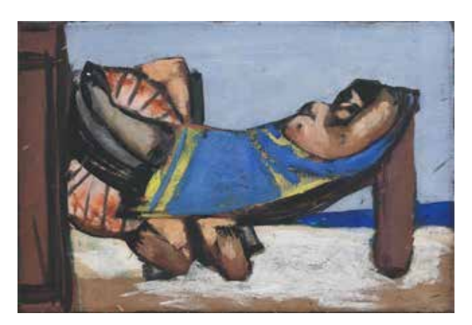
Max Beckmann. "Hängematte". 1942 Oil on canvas. 24 × 36 cm. EUR 300,000-400,000