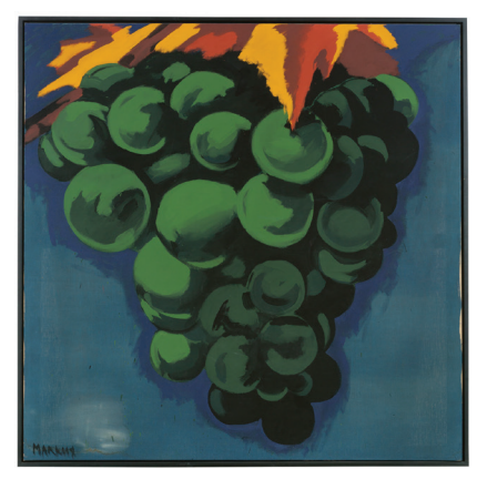
Markus Lüpertz. Weintraube. 1971 Distemper on canvas. 200 × 200.5 cm. EUR 100,000–150,000