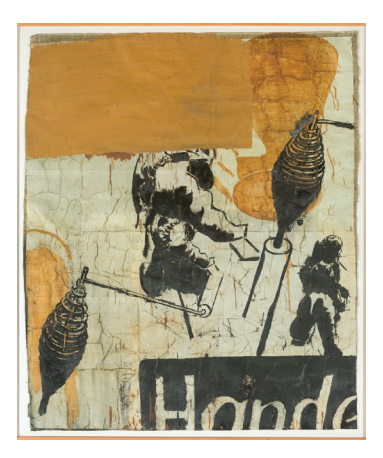
Neo Rauch. Hände. 1993 Oil and shellac on paper, collaged, on canvas. 145.5 \times 123 cm EUR 100,000–150,000