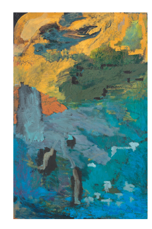
Per Kirkeby. "Die Zeit nagt I". 1992 Oil on canvas. 200 × 130 cm. EUR 150,000–200,000