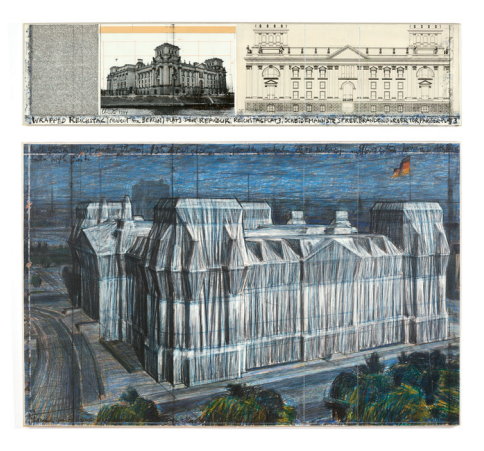
Christo. "Wrapped Reichstag (Project for Berlin)". 1994 2-part: collage on paper and coloured chalk on paper, each firmly mounted on panel and in original plexiglass frame. 38 × 165 cm and 106.6 × 165 cm. EUR 300,000-400,000