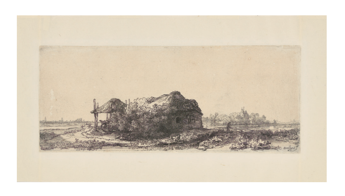
Rembrandt Harmenszoon van Rijn "Landscape with a cottage and haybarn: oblong". 1641 Etching on laid paper, laid down on Japan paper. Plate: 12.7 \times 32 cm (paper: 13 \times 32 cm, 20.5 \times 38.4 cm) Estimate EUR 50,000-70,000