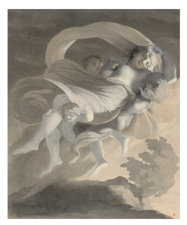
Pierre-Paul Prud'hon "L'Enlèvement de Psyché". Circa 1808 Black chalk over pencil, washed grey and heightened with opaque white, on heavy paper. 53.6 × 44.3 cm Estimate EUR 200,000–300,000