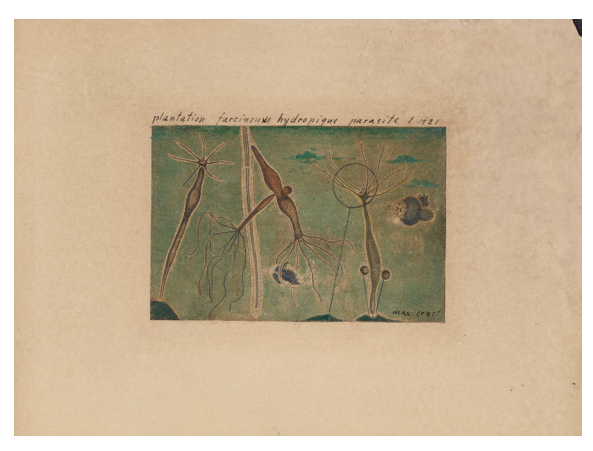
Max Ernst "Plantation farcineuse hydropique parasite". 1921 Watercolour and pencil, overpainting of a print, laid down on cardboard. 7.8 × 11.8 cm (17.9 × 22.9 cm) EUR 40,000-60,000