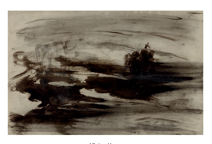
\begin{tabular}{ll} Victor Hugo \\ Carnet Guernesey. 1856 \\ Ink, gouache and opaque white in black on paper, laid down on paper. \\ 24.4 \times 38.2 \ cm \\ Estimate EUR 100,000–150,000 \\ \end{tabular}