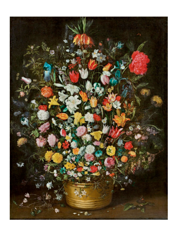
Jan Brueghel d.J. "Großer Blumenstrauß mit Kaiserkrone im Holzbottich". Circa 1625/30. Oil/canvas. Estimate 800,000–1,200,000