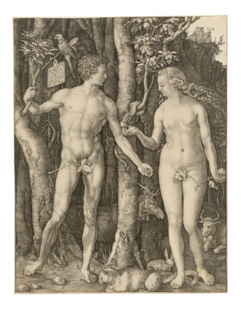
Albrecht Dürer. "Adam und Eva". 1504 Copper engraving on laid paper. Estimate EUR 80,000–120,000