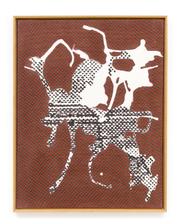
Sigmar Polke. Untitled. 1993. Emulsion paint and acrylic on patterned fabric. Estimate EUR 300,000–400,000