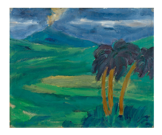
Emil Nolde. "Südsee Landschaft II". 1915 Oil on canvas. Estimate EUR 800,000–1,200,000