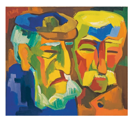
Karl Schmidt-Rottluff. "Pommersche Bauern". 1924 Oil on canvas. Estimate EUR 400,000-600,000