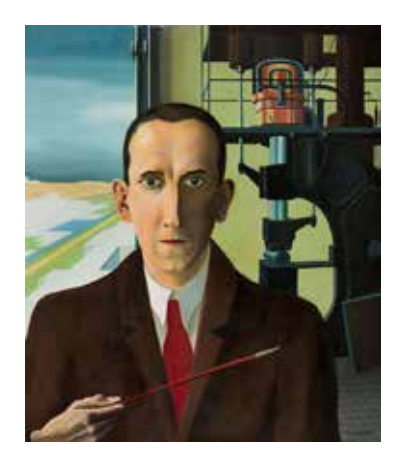
Carl Grossberg. Self portrait. 1928 Oil on panel. EUR 300,000–400,000