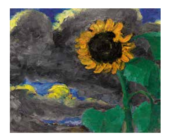
Emil Nolde. "Sonnenblume". 1928 Oil on panel. EUR 700,000–1,000,000