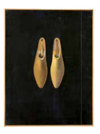
Konrad Klapheck. "ähnliche Eltern". 1957 Oil on canvas. EUR 200,000-300,000