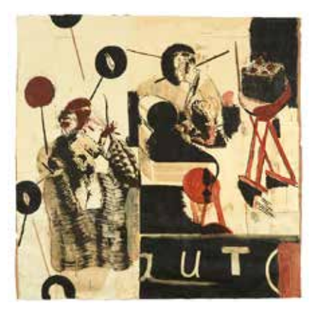
Neo Rauch. Autor. 1994 Oil on paper, collaged on linen. EUR 300,000-400,000