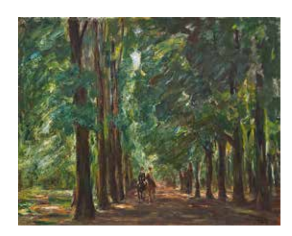
Max Liebermann. "Reiter in der Allee bei Sakrow". 1924 Oil on canvas. EUR 500,000–700,000