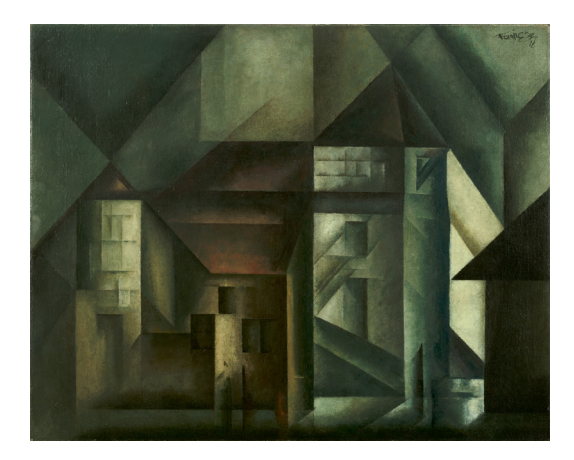
Lyonel Feininger. "Vollersroda III". 1916. Oil on canvas. Relined. 80 \times 100 cm. EUR 1,000,000–1,500,000