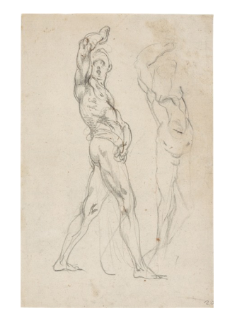
Jacopo da Pontormo. Study of a Walking Man ("Studio di uomo che cammina"). Circa 1517. Black chalk on laid paper. 25.6 × 16.9 cm. EUR 250,000–350,000