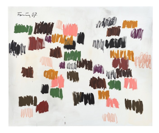
Günther Förg. Untitled. 2007. Acrylic and oil crayon on canvas. 201 \times 240.3 cm. EUR 400,000–600,000