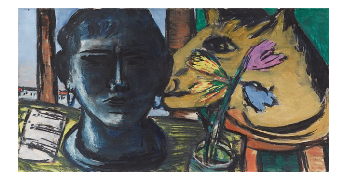
Max Beckmann. "Stillleben mit Skulptur". 1942. Oil on canvas. 45 × 85 cm. EUR 600,000-800,000