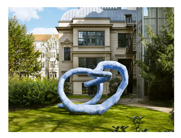
Franz West. "Flora". 2006. Aluminium, lacquered. 300 × 430 × 200 cm. EUR 600,000–800,000