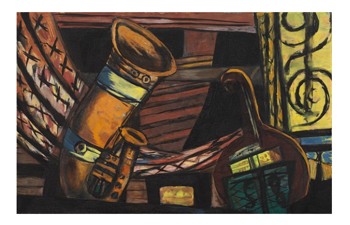
Max Beckmann. "Orchester". 1932. Oil on canvas. 89 × 138.5 cm. EUR 1,000,000-1,500,000