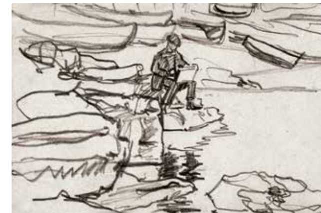
Gabriele Münter. Kandinsky in Rapallo . Pencil/paper. 1906

The late Impressionist “small oil studies,” as Kandinsky called them, were created between 1901 and 1907. They certainly are early masterpieces of his plein-air painting, but beyond that, they also serve as harbingers of a revolutionary new period in Kandinsky’s creative evolution. As exploratory steps towards the Expressionism and abstraction that would characterize his painting in later years, they allow us to experience the gestation of his ground-breaking artistic vision.