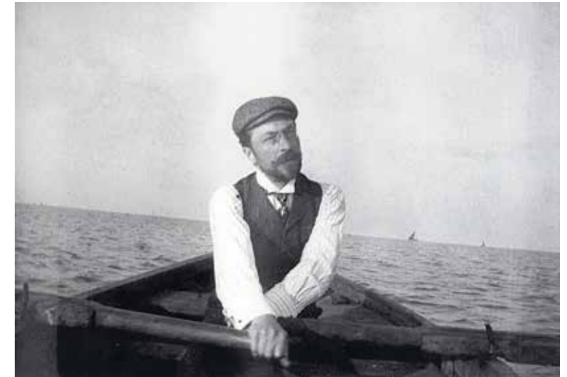
Gabriele Münter. Kandinsky im Ruderboot . 1905/06

The photographs from their sojourn in Rapallo show Kandinsky sitting in a rowboat, or a wide shot of Münter posing on the beach against a panoramic backdrop of Rapallo. Here as well, the Castello is visible in the distance. A pencil drawing by Münter captures Kandinsky in the Bay of Rapallo, engrossed in a drawing or perhaps even an oil study. These works created on the spot provide important first-hand testimony of the unconventional relationship between these two creative personalities. One which eventually would falter due to Kandinsky’s failure to honour his oft-repeated promise to openly acknowledge his bond with Münter.